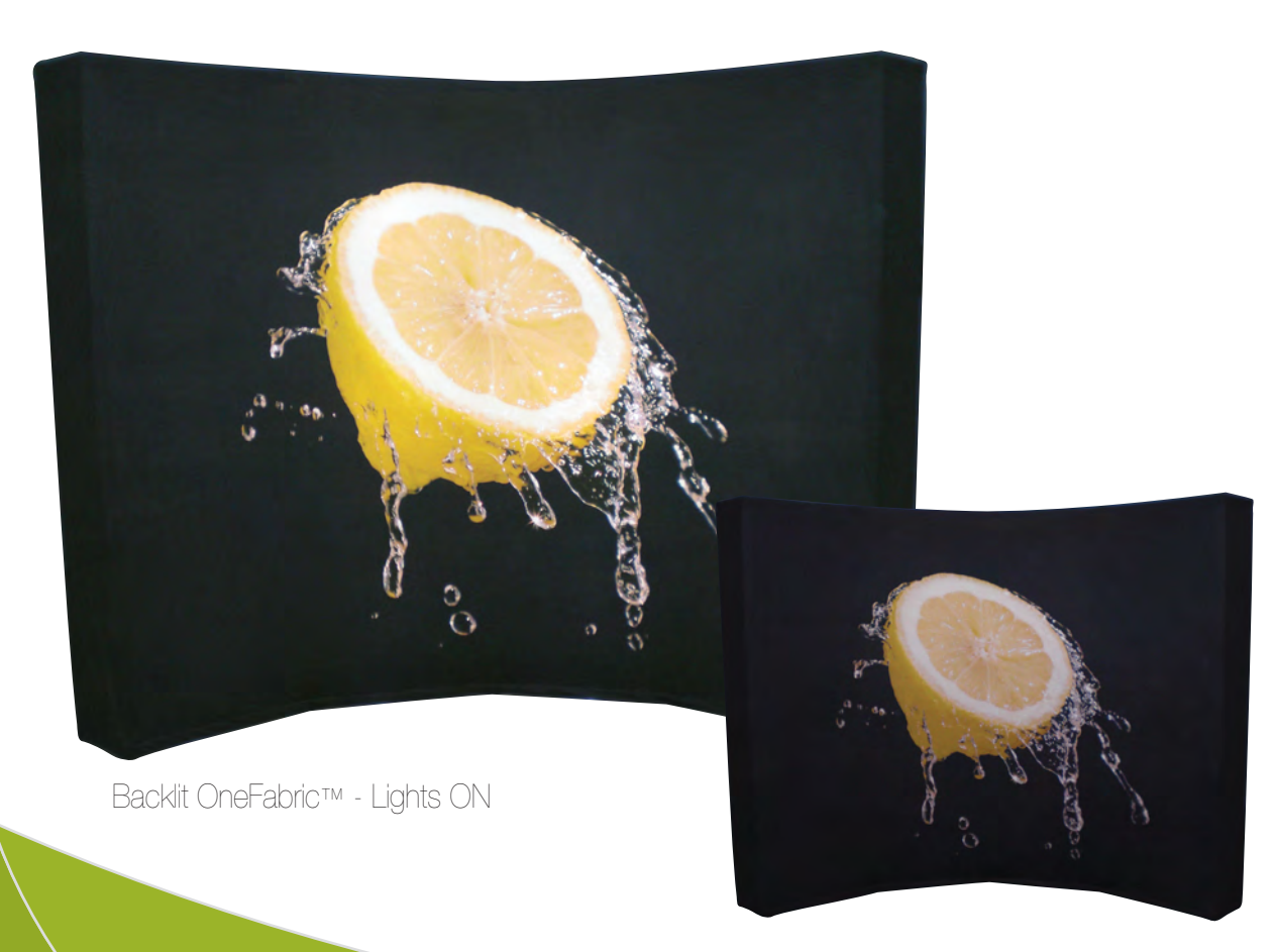
Backlit OneFabric™ - Lights OFF