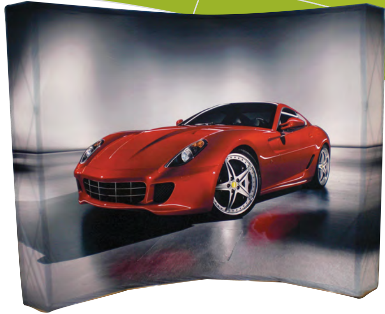
Backlit OneFabric™ - Lights ON

Our exclusive lighting system creates images with color and pop far beyond what traditional front lit systems achieve.