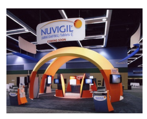
For more information about the Nuvagil booth design, see case study on page 4.

"THE USE OF TENSIONED FABRIC HAS CHANGED FROM JUST A FEW SMALL PIECES, MAYBE HANGING SIGNAGE, TO BEING THE MAIN FOCUS OF A BOOTH"