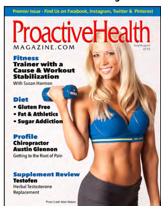
Front Page Magazine Coverage Copies Provided To Your Office Social Media Likes and Coverage 2 Month Shelf Life